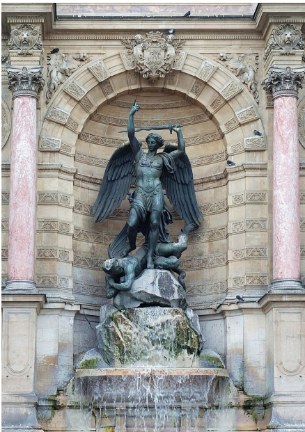
St Michael's Fountain, on Boulevard Saint-Michel, Paris, sculpted by Francisque-Joseph Duret 1860.

St. Michael the Archangel, defend us in battle. Be our protector against the wickedness and snares of the devil. May God rebuke him, we humbly pray; And do Thou, O Prince of the Heavenly Host, by the power of God, cast into hell Satan, and all the evil spirits who prowl about the world seeking the ruin of souls.