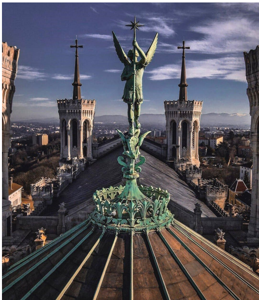
Saint Michael Archangel Michael on the roof of the Basilique Notre Dame de Fourvière in Lyon, France.

St. Michael the Archangel, defend us in battle. Be our protector against the wickedness and snares of the devil. May God rebuke him, we humbly pray; And do Thou, O Prince of the Heavenly Host, by the power of God, cast into hell Satan, and all the evil spirits who prowl about the world seeking the ruin of souls.