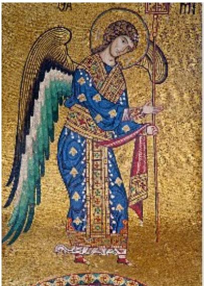
Mosaic of Archangel Michael from Church of Santa Maria dell' Ammiraglio from 12. cent. in Palermo, Italy.

St. Michael the Archangel, defend us in battle. Be our protector against the wickedness and snares of the devil. May God rebuke him, we humbly pray; And do Thou, O Prince of the Heavenly Host, by the power of God, cast into hell Satan, and all the evil spirits who prowl about the world seeking the ruin of souls.