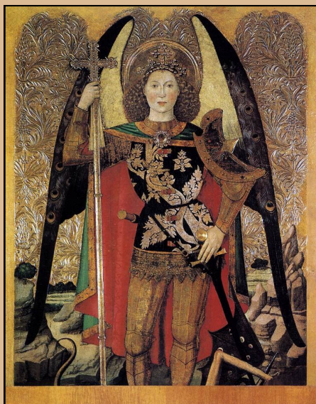
Michael the Archangel by Jaime Huguet, 1456 Tempera on panel, 213 x 136 cm Museu Nacional d'Art de Catalunya, Barcelona

St. Michael the Archangel, defend us in battle. Be our protector against the wickedness and snares of the devil. May God rebuke him, we humbly pray; And do Thou, O Prince of the Heavenly Host, by the power of God, cast into hell Satan, and all the evil spirits who prowl about the world seeking the ruin of souls.